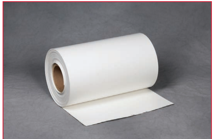
VersiWeld's TPO Flashing is a non-reinforced thermoplastic polyolefin based membrane used for field fabricated pipe flashings, sealant pockets and scuppers when the use of a pre-molded accessory is not feasible.