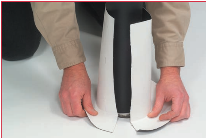
VersiWeld TPO Split Pipe Seals are fabricated flashings made of 45-mil reinforced VersiWeld membrane. Split (cut) and overlap tabs allow the pipe seals to be opened and wrapped around a round pipe with an obstruction.

Innovative, Flexible, Efficient, High-Performing & Economical. Versico, a leader in the manufacturing and sale of quality heat-weldable TPO membranes and accessories, introduces VersiWeld pre-fabricated TPO accessories and flashings. Offering economical solutions to field fabrication in both standard and custom hard-to-flash situations, contractors and owners are saving time and money with Versico's easy-to-install, pre-fabricated accessories.