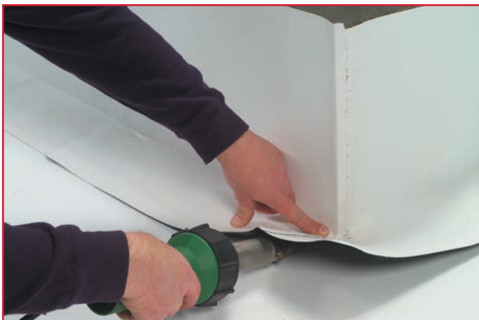
VersiWeld TPO Curb Wrap Corners are made of 45-mil reinforced VersiWeld membrane. With six sizes available to fit curbs up to 6' by 6', this innovative product reduces installation time compared to conventional flashing methods.