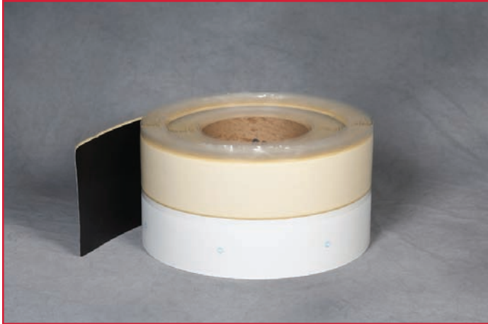
VersiWeld's TPO QA RTS is a reinforced TPO membrane strip with a quick applied tape laminated along one edge. Placed below the deck membrane, TPO QA RTS provides membrane securement at angle changes without penetrating the sheet.