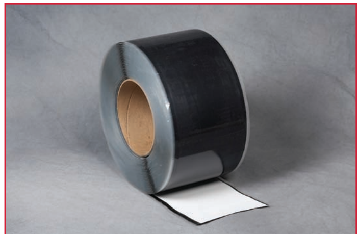
VersiWeld QA Cover Strip is reinforced TPO membrane laminated to a fully cured synthetic rubber quick applied adhesive. Available in white, gray and tan, QA Cover Strip provides maximum protection against inclement weather and is ideal for seams and stripping in metal edge flashings.