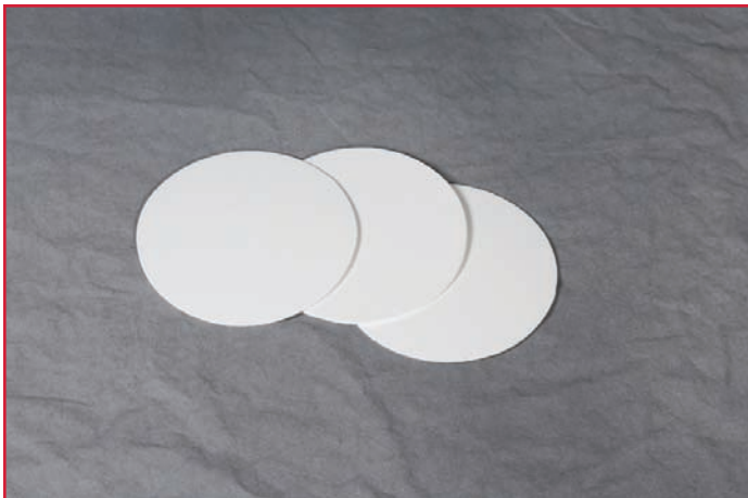
VersiWeld's TPO T-Joint Covers are a pre-punched, non-reinforced flashing used to seal "T-joint" intersections on 60-, 72-, and 80-mil TPO membranes.